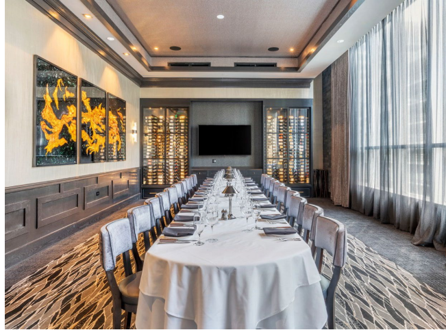
Private Dining Areas