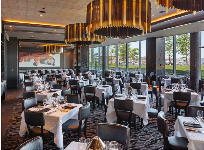
Modern & Chic Decor