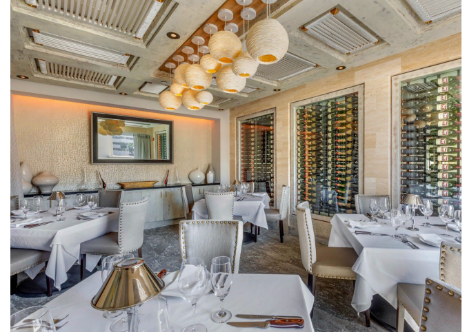
Elegant Wine Display