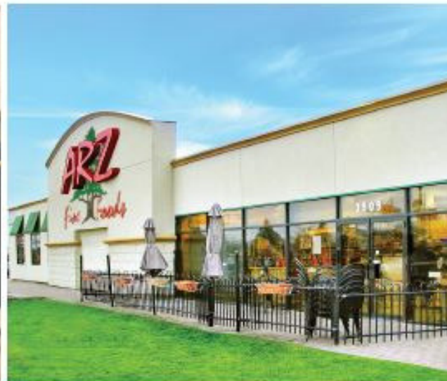
2001 Expanded Store, Better Location