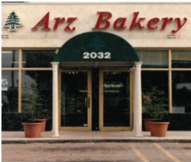
1996 Specialty Bakery