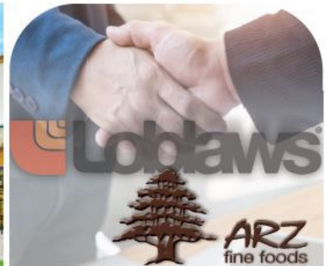
2014 Loblaws Companies Ltd. And Arz Group Ltd. Partnership.