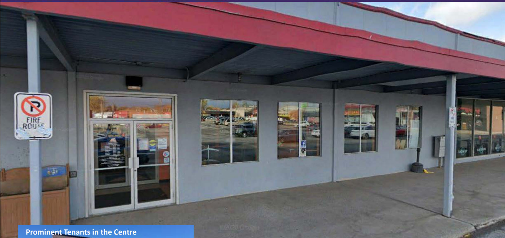
Prominent Tenants in the Centre