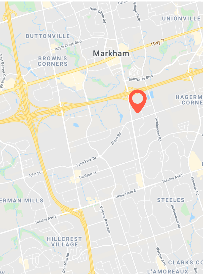
95 Royal Crest Court, Markham Units 13&14 SITE PLAN