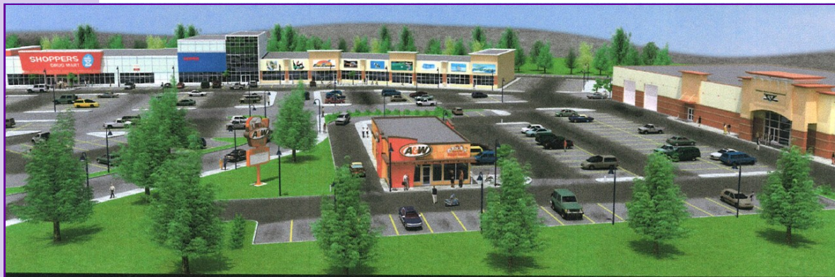
Morris A. Feldman Development

Second floor office space available above Shoppers Drug Mart