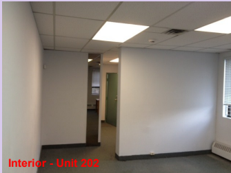
Interior - Unit 202