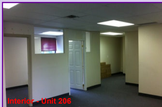
Interior - Unit 206