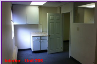
Interior - Unit 205