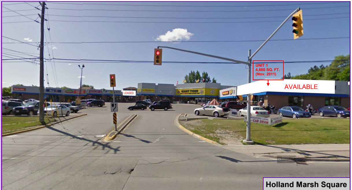
Holland Marsh Square