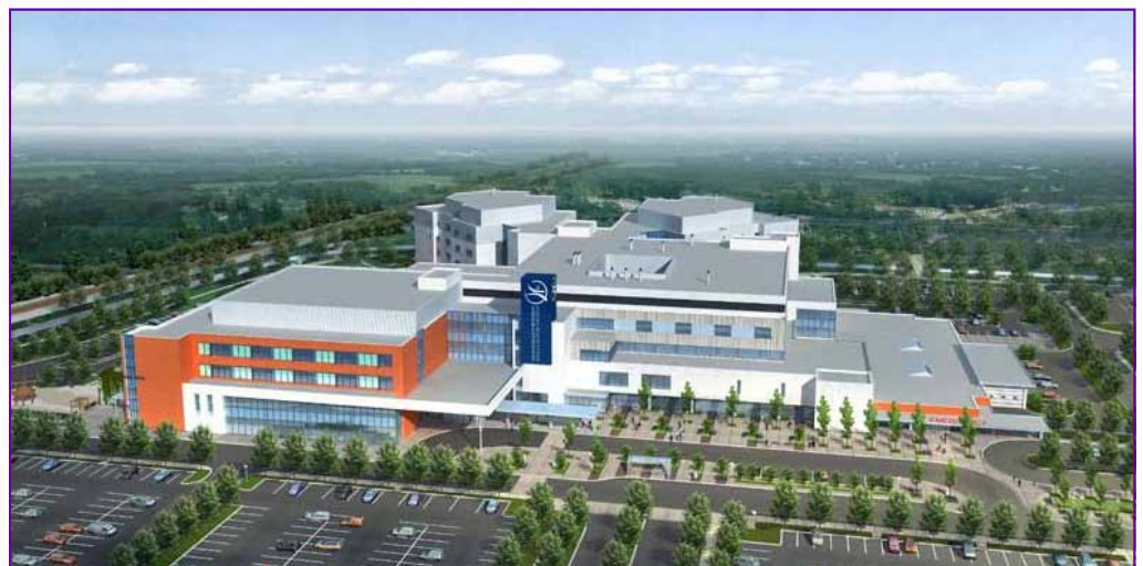
Preliminary concept of the new Niagara Health System Health Care Complex by Plenary Health

CEO, Broker 416.636.8898 ext. 227 416.636.8890 fax abehar@thebehargroup.com