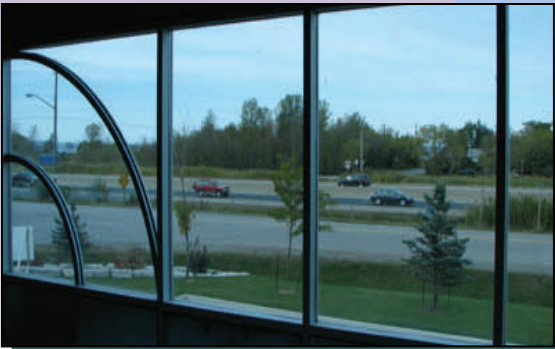
Second floor view of QEW

Accessed from Fruitland Road exit off QEW