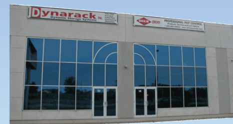
Existing Unit Owners