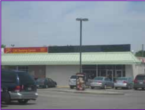
Kipling Heights Centre